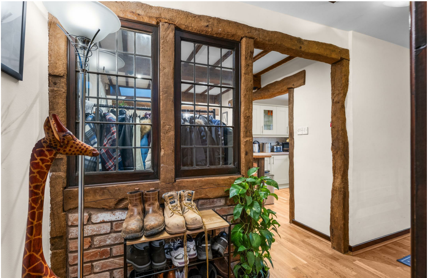
4 Sherbourne Court, Vicarage Lane, Sherbourne, Warwick,